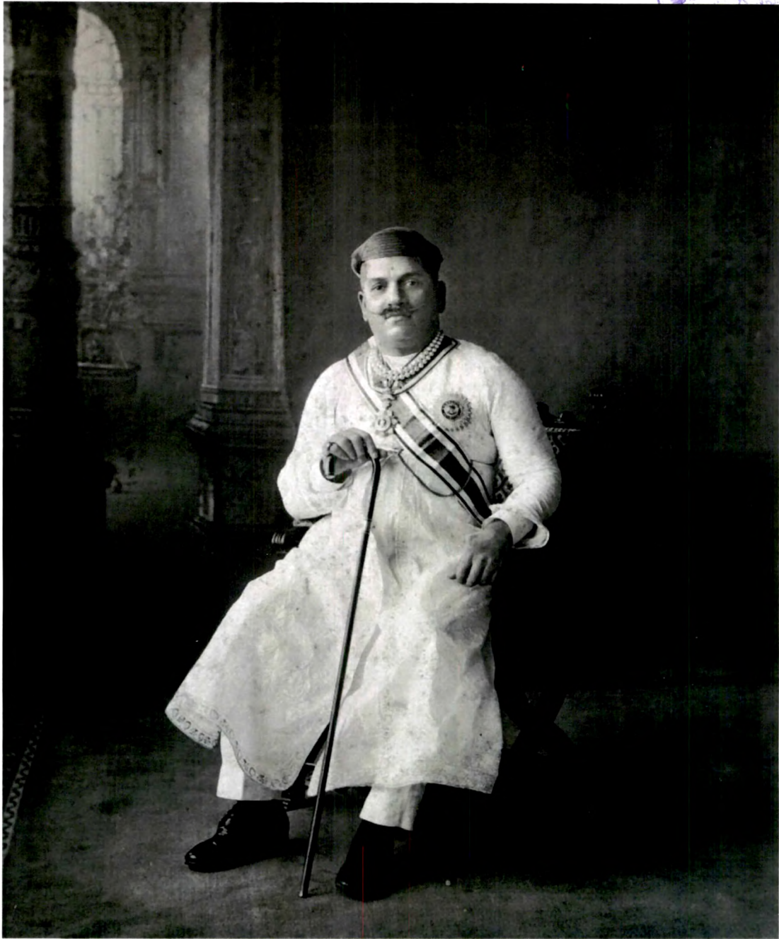
In Fond Memory Of H.H. SIR SAYAJIRAO GAEKWAD