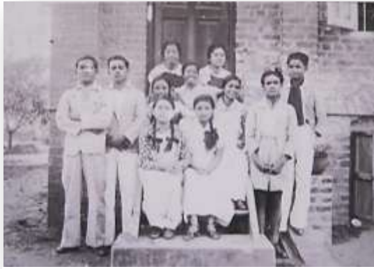
Students who were sent to Meiktila, 1934