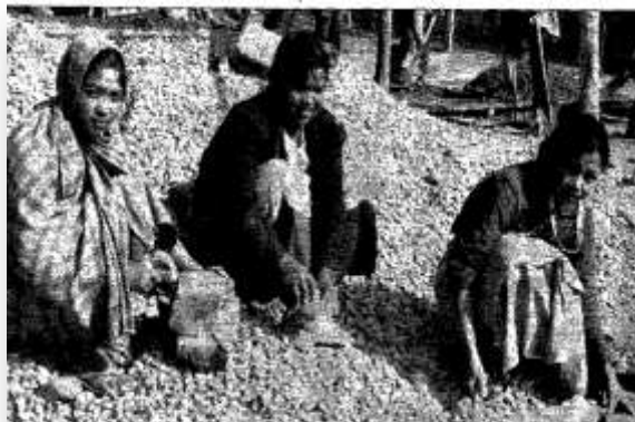
The Female students during their vocational training at ATS, 1967.