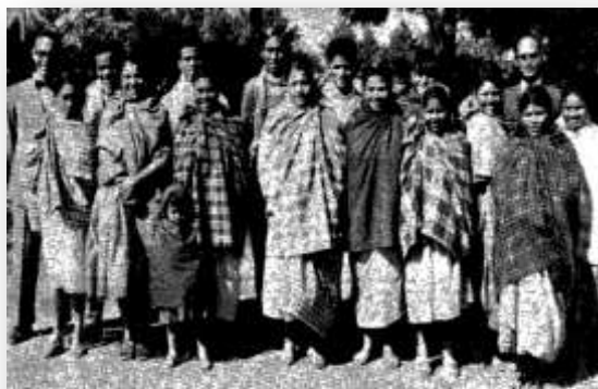
A group of students were baptised at ATS in June 1967.