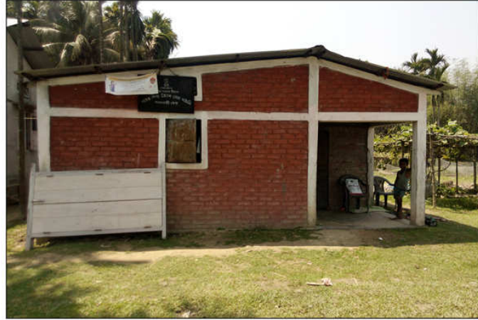
Anganwadi Centre of Rupahi Development Block