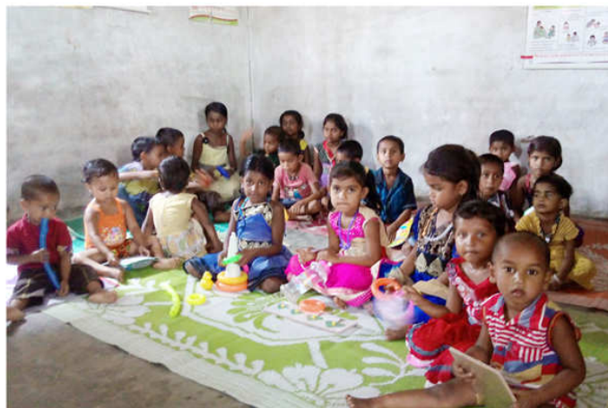
Activities at Angawadi Centre