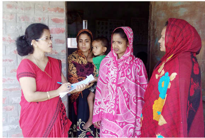
Invcestigator at the AWC