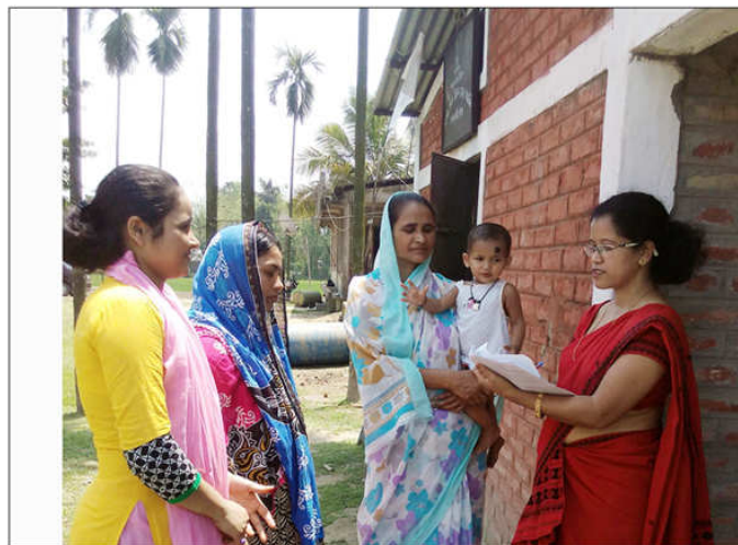
Invcestigator with the respondents at the AWC