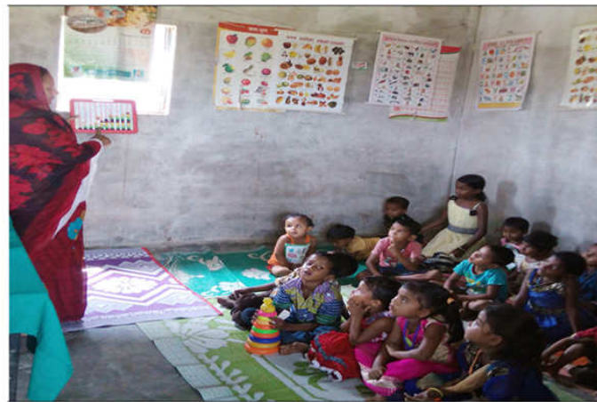
Teaching Activities at Angawadi Centre