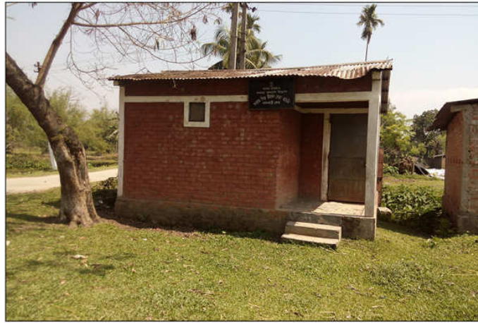
Anganwadi Centre of Rupahi Development Block